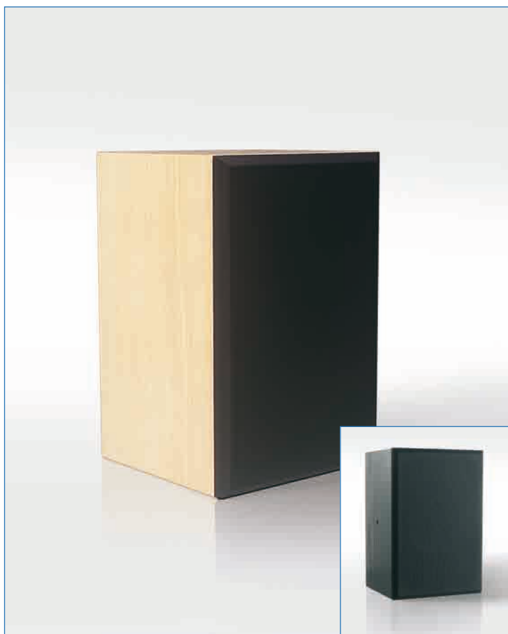
MX2 loudspeaker shown with natural varnish wood (MX2) and black varnish wood (MX2N) finish

APG team recommends the following subwoofers: SUB12MX/N, SUB138P/S.